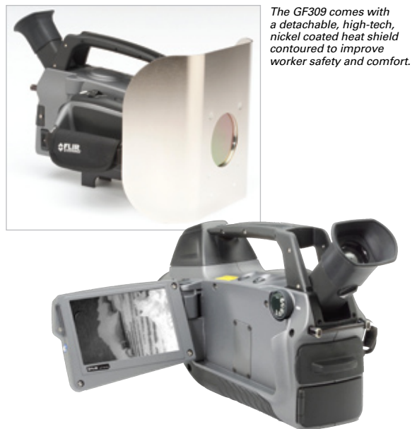
The GF309 comes with a detachable, high-tech, nickel coated heat shield contoured to improve worker safety and comfort.

1 800 464 6372 | www.goinfrared.com/see 1 978 901 8000